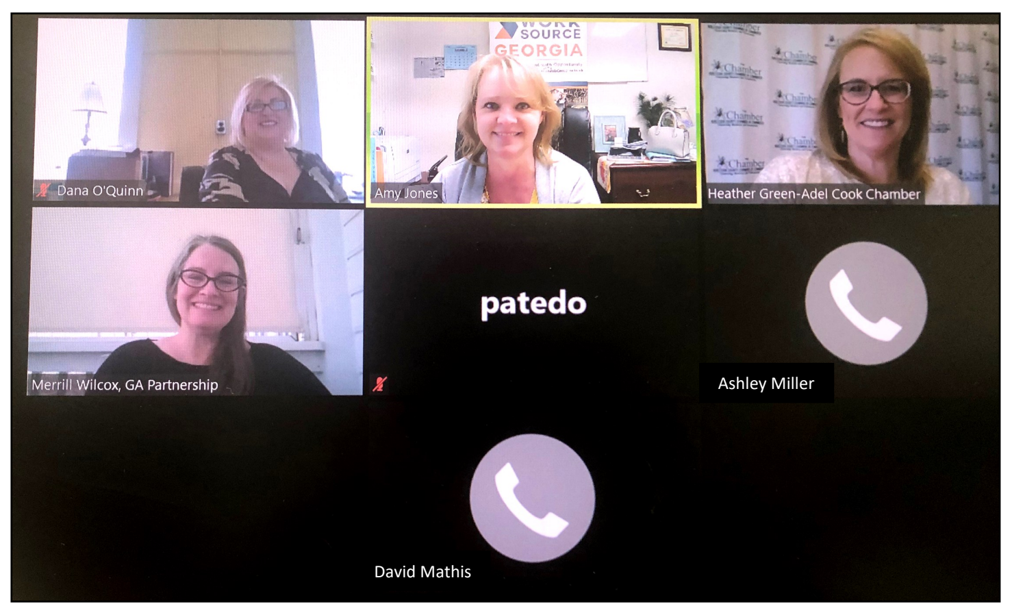
Pictured above are participants in the recent Region 11 Chamber Check-In event, held via Zoom.