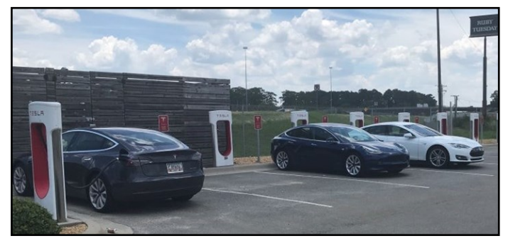
Pictured above: Tesla EV charging stations in Tifton

Some localities install EV charging stations and do not charge a user fee. This benefit can be a powerful incentive to visitors and travelers to stop in those localities especially if EV owners notice restaurants, coffee shops, etc. to visit while stopping to charge their EV.