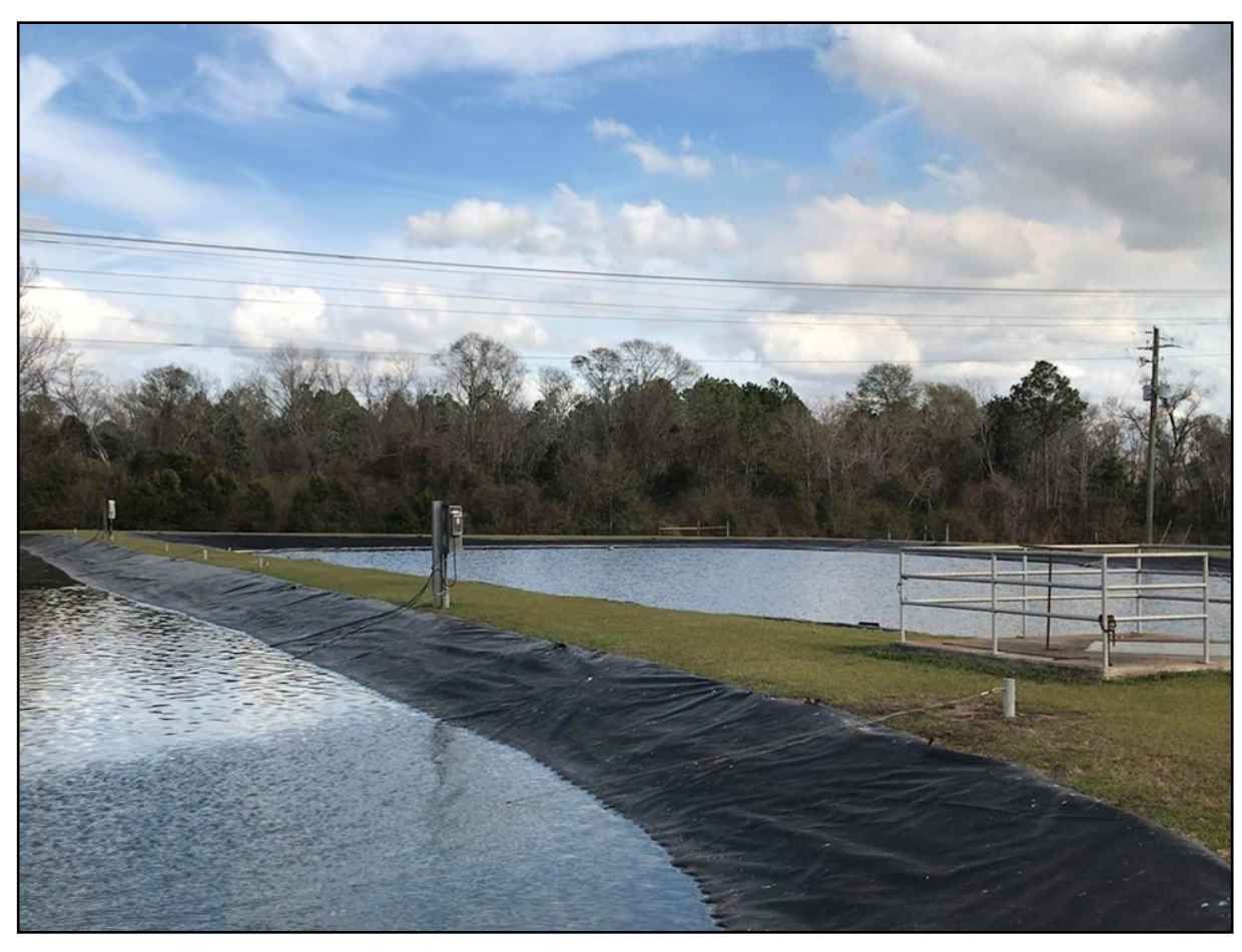
City of Sycamore Wastewater Treatment Facility

The successful EDA grant application was written and submitted by the Southern Georgia Regional Commission. SGRC Community and Economic Development staff will administer the project.