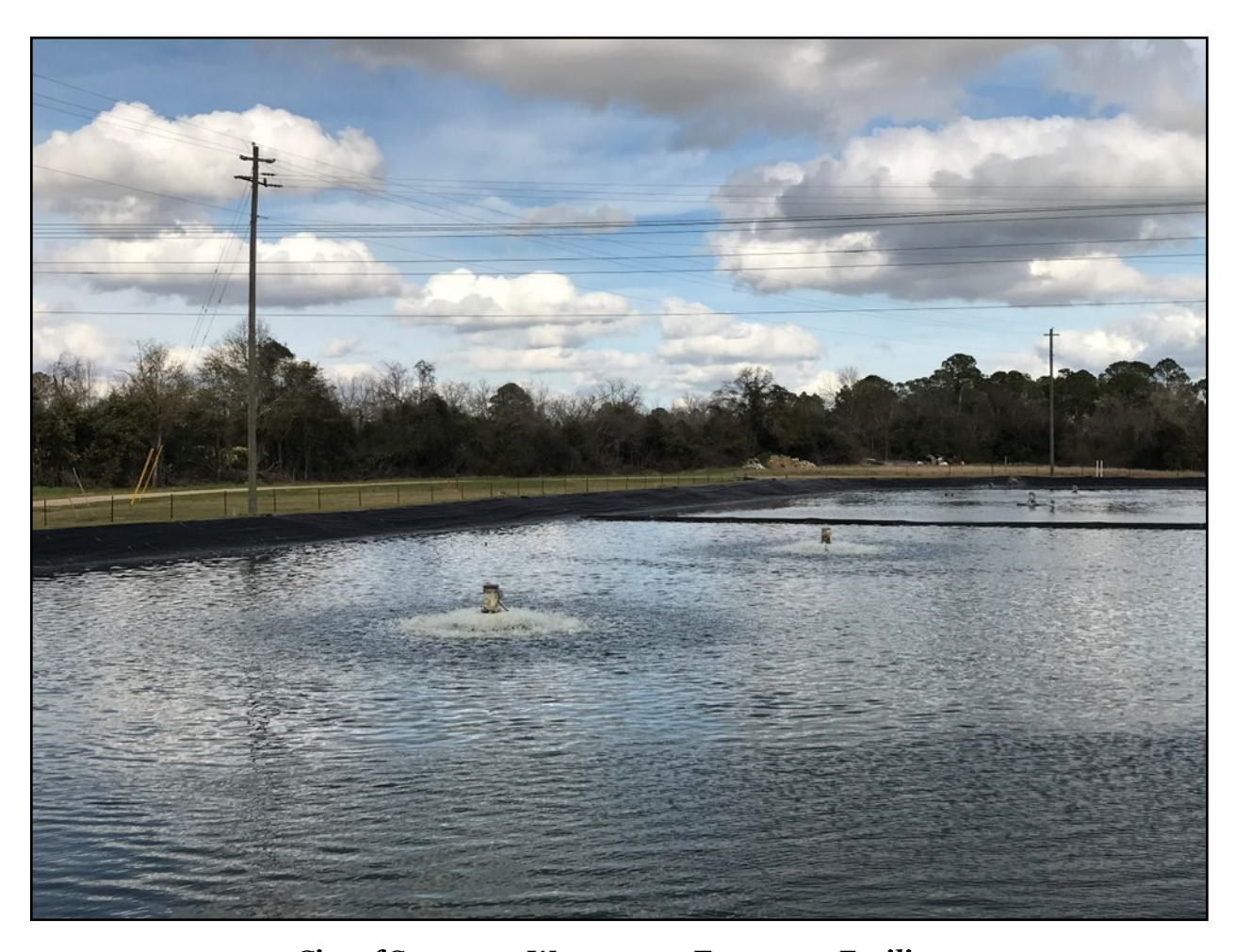
City of Sycamore Wastewater Treatment Facility