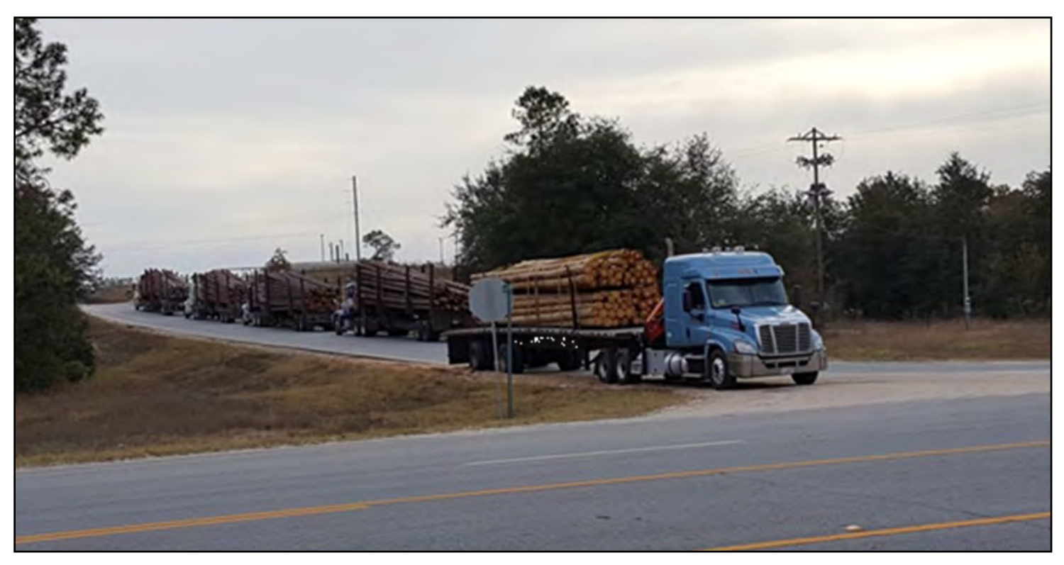
Truck traffic at the entrance of Beach Timber is often severely congested, and this issue will only worsen due to the increased number of trucks resulting from the expansion. The new roadway will allow for safe access in and out of the growing sawmill.

The successful CDBG-EIP grant application was written and submitted by the Southern Georgia Regional Commission. SGRC Community and Economic Development staff will administer the project.