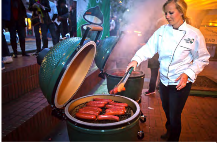
Pictured above: Wine & Food Festival picture of Big Green Egg

Identify and utilize outdoor areas for public participation to the extent possible - public hearings can be held outdoors with a bit of advance preparation. Additional needs may include loudspeakers, tents, and accessible seating.