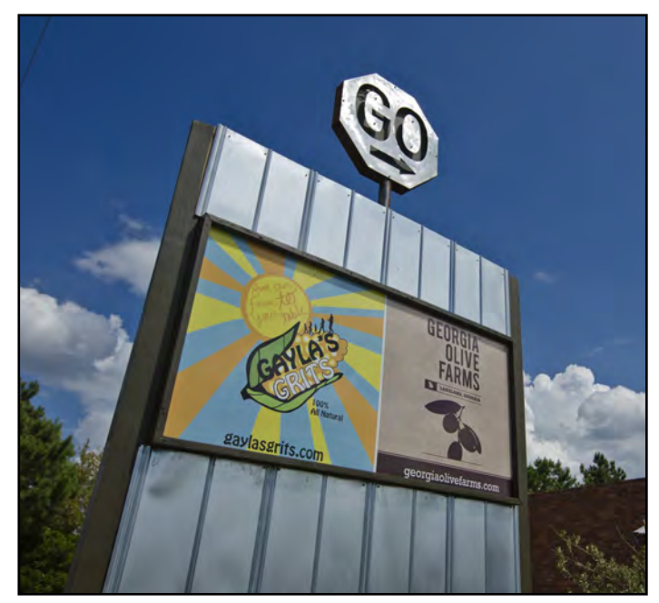
Pictured above: Georgia Olive Farms, Lakeland, GA

In addition to practicing physical distancing and wearing facemasks, continuing and even increasing outdoor activities during the upcoming colder weather and flu season is advised. The shelter-in-place order in Georgia took not only an economic toll, but also exacerbated mental health and substance abuse issues. If people spend more time outdoors this winter, they will not only be exposed to fresh air and sunshine but will also experience greater ventilation and