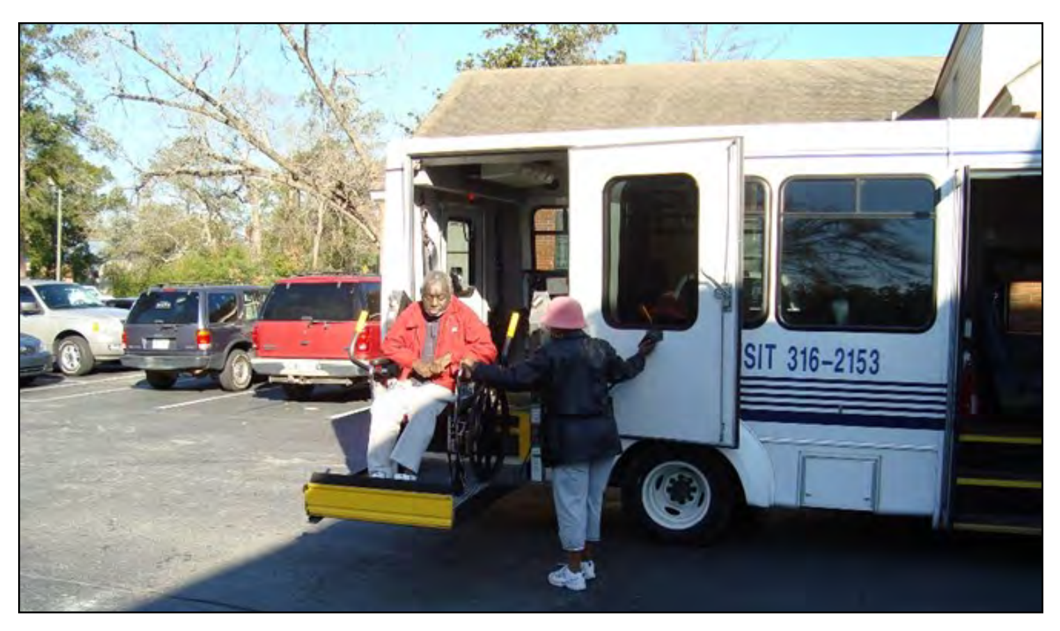
Pictured above: a participant gets a ride from a regional transit provider.