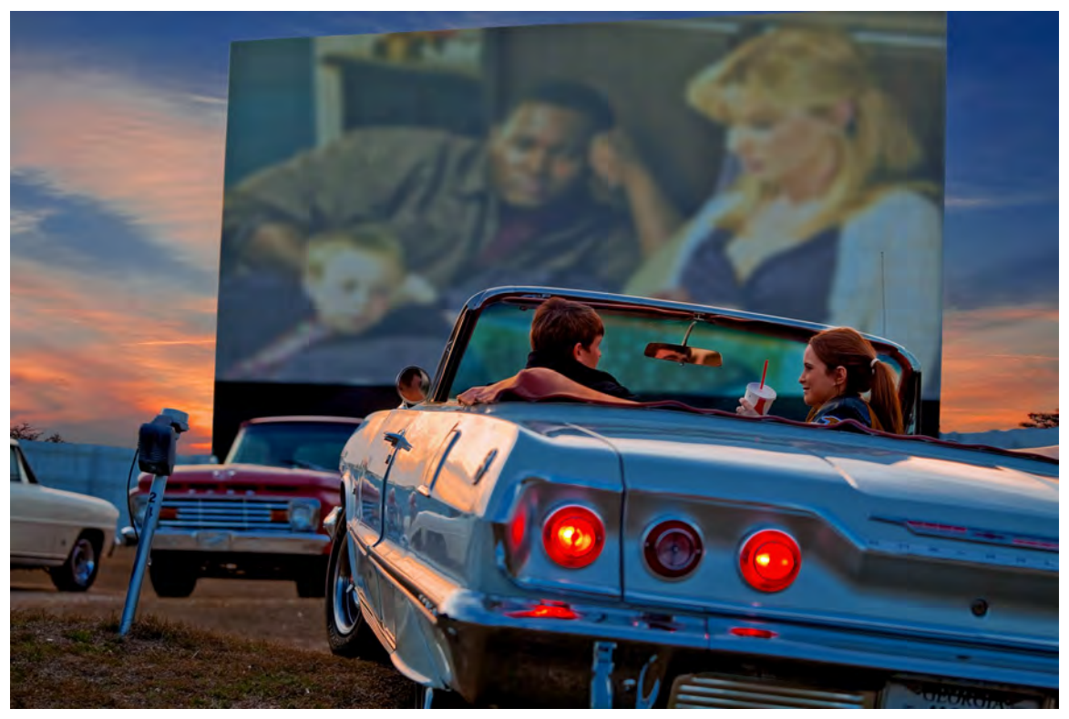
Drive-in Theater, Jesup, GA

For additional details and localized assistance, SGRC Planning staff are available at (229) 333-5277.