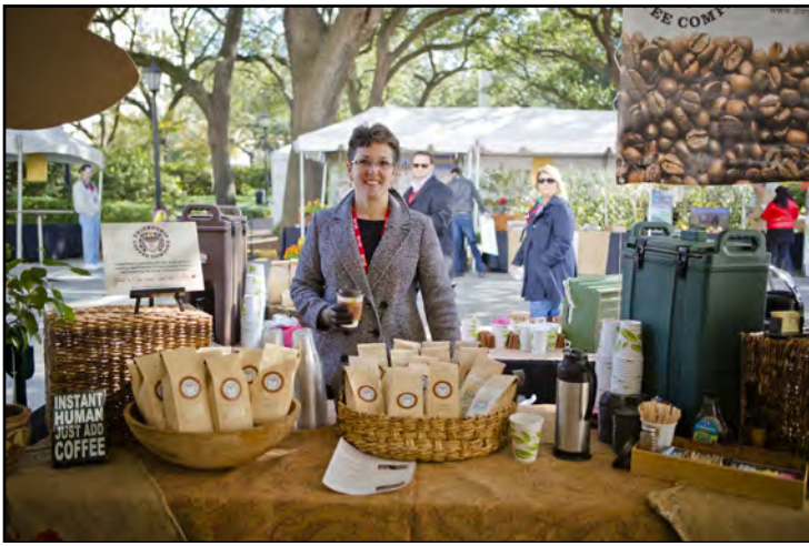
Pictured above: Wine & Food Festival picture of periences can be theme and/or holiday based Friendship Coffee Company

ties across separate geographies can link their themes and encourage cross promotion between and amongst their communities.