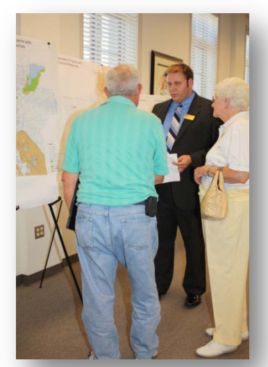
Figure 2 VLMPO staff answering a question about the 2035 Transportation Plan.

The VLMPO has continued to use its website as its primary mechanism for distributing information to the public, resource agencies and planning partners. In addition to its website the VLMPO has begun using social media websites like Facebook to disseminate information quickly and to new audiences. Website statistics regularly show that when the VLMPO releases a new plan, report or other significant documentation that website traffic sees double digit percentage increases. An example of this is when the VLMPO presented its 2035 TP for public comment on July 18, 2010 page loads increased from an average of 10 per