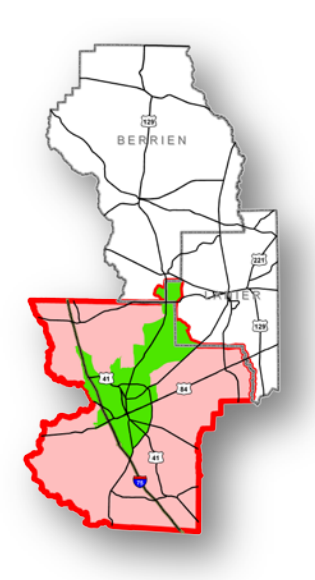
Figure 1 VLMPO Metropolitan Planning Area

Over the past year the VLMPO has focused on developing projects and engaging the public in the Metropolitan Planning Area (all of Lowndes County and portions of Berrien and Lanier Counties). The 2035 Transportation Plan which will be adopted in September 2010 is a guiding document of policies and projects for transportation, land use, safety, environmental sustainability, economic development, and improved quality of life.