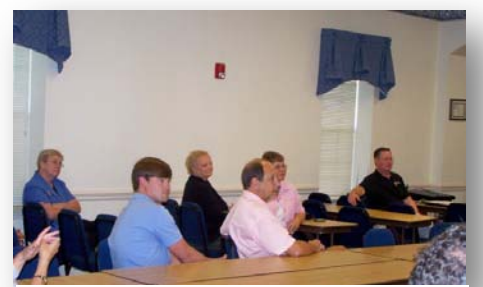
Figure 3 Attendees at the 2010 Georgia Transit Day hosted by SGRC.

has engaged the public during the past year. Under each strategy listed below are this year's measurements of the VLMPO engagement of the public.